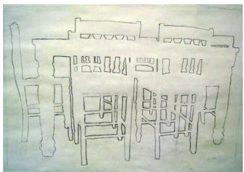
step 2 /contour fused stage