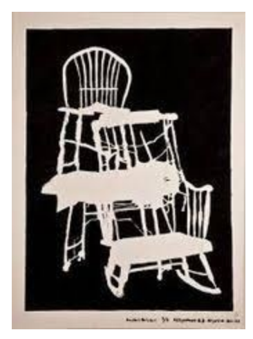
Step 4 / Inked in final version